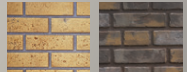
DECORATIVE SANDSTONE AND NEWPORT™ BRICK PANELS